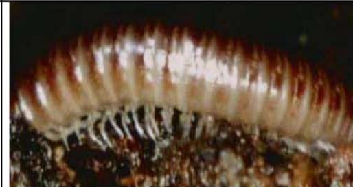
CENTIPEDE & MILLIPEDE