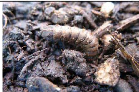
SOLDIER FLY LARVA